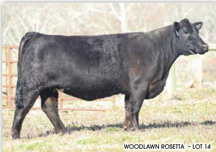
WOODLAWN ROSETTA - LOT 14