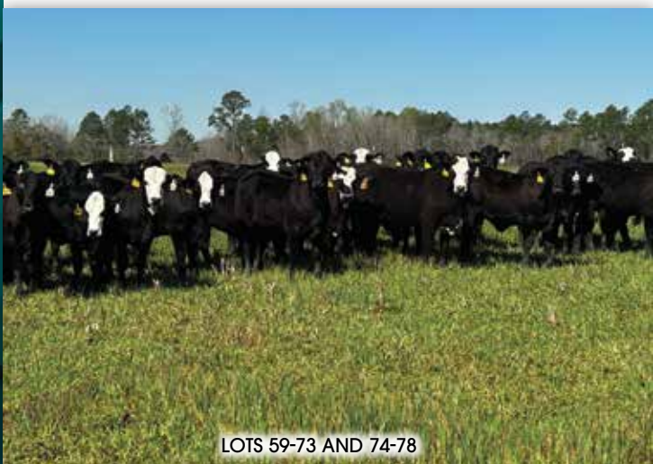
LOTS 59-73 AND 74-78