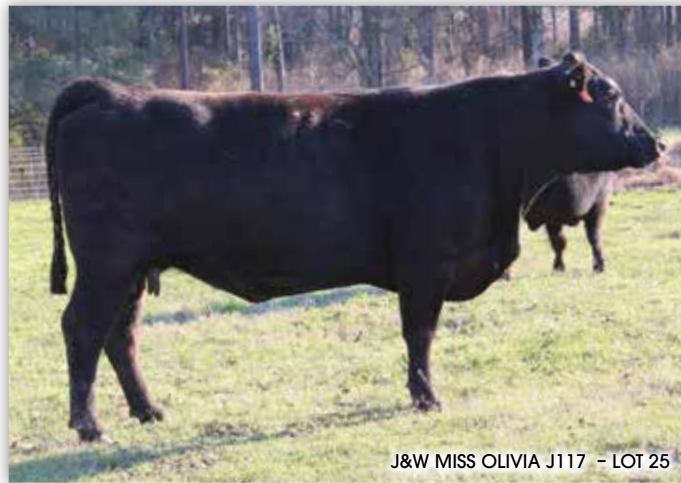
J&W MISS OLIVIA J117 - LOT 25