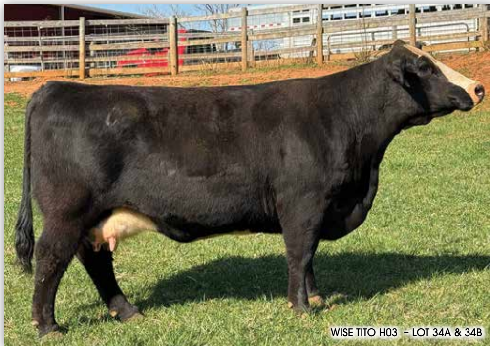
WISE TITO H03 – LOT 34A & 34B