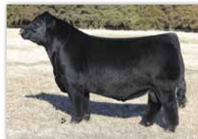
JSUL SOMETHING ABOUT MARY SIRE OF LOT 34B