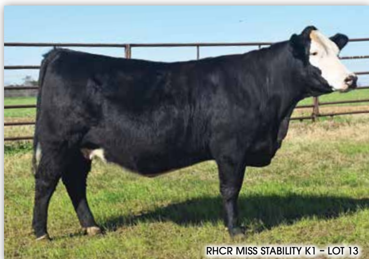
RHCR MISS STABILITY K1 - LOT 13