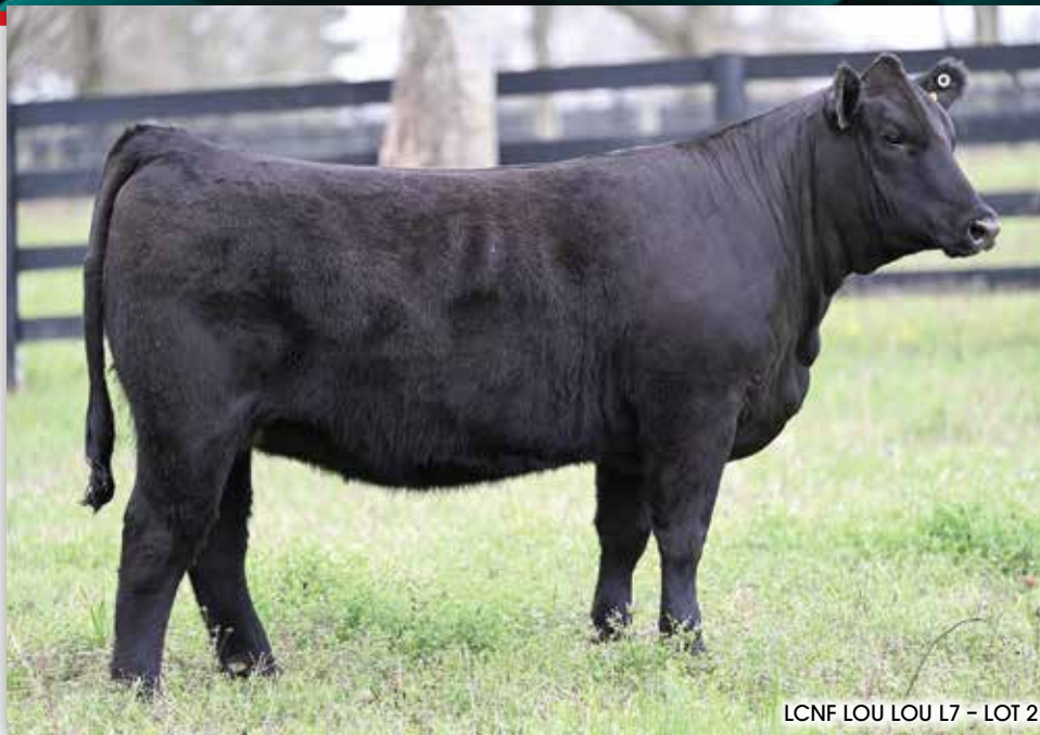
LCNF LOU LOU L7 - LOT 2