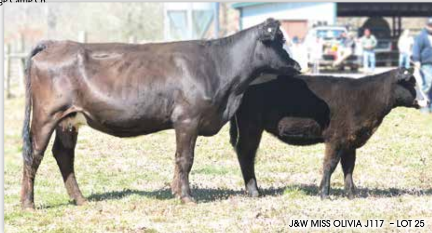
J&W MISS OLIVIA J117 - LOT 25