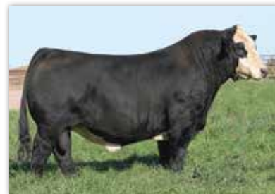
W/C BANKROLL SIRE OF LOT 34A