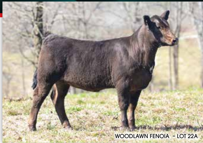
WOODLAWN FENOIA - LOT 22A