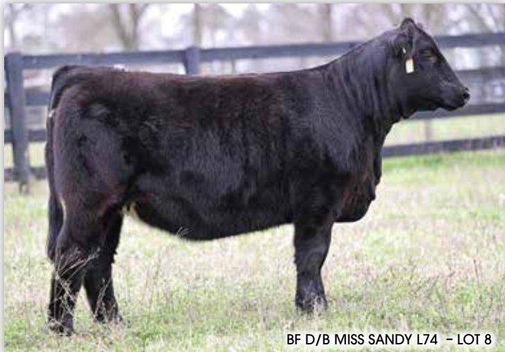
BF D/B MISS SANDY L74 - LOT 8

| PE from 1/17/25 to 3/17/25 to WHF Lover Boy K003 consignor Boyd Farm