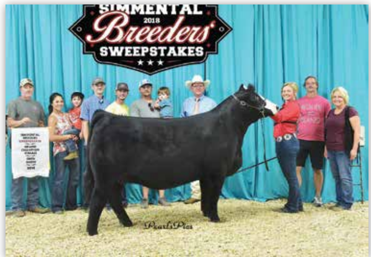
HPF VICTORIA B396E GRANDDAM OF LOT 1

PE from 1/17/25 to 3/17/25 to WHF Lover Boy K003 consignor Boyd Farm