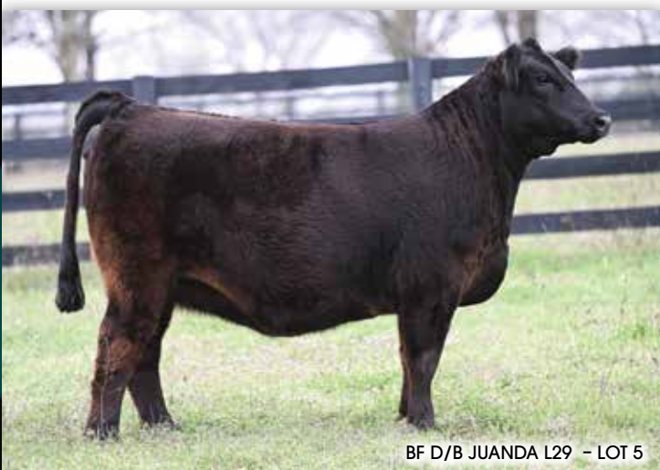
BF D/B JUANDA L29 - LOT 5