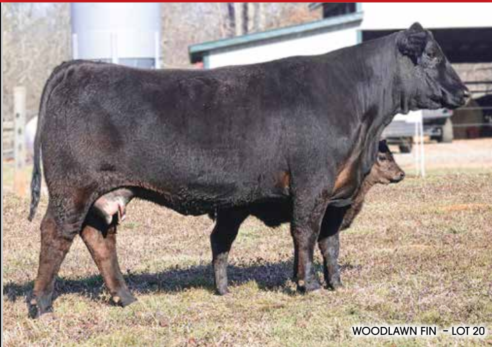
WOODLAWN FIN - LOT 20