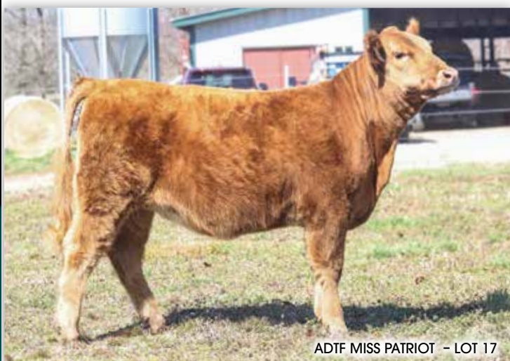
ADTF MISS PATRIOT - LOT 17