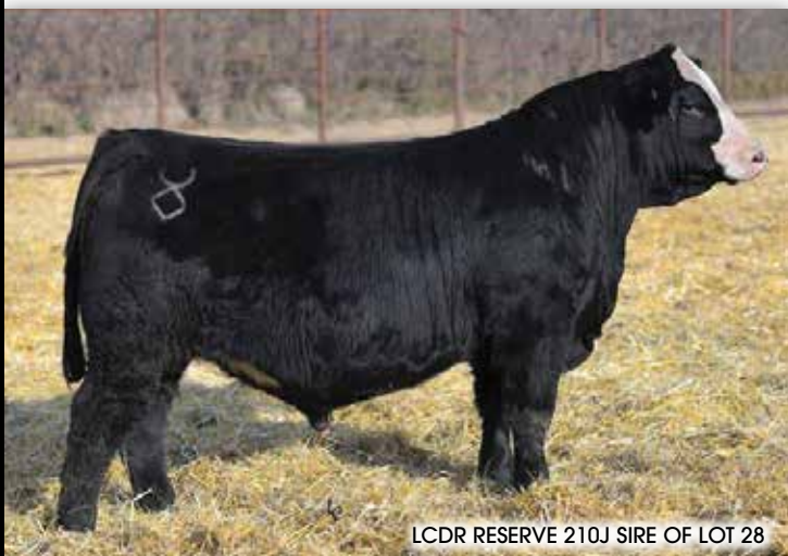
LCDR RESERVE 210J SIRE OF LOT 28