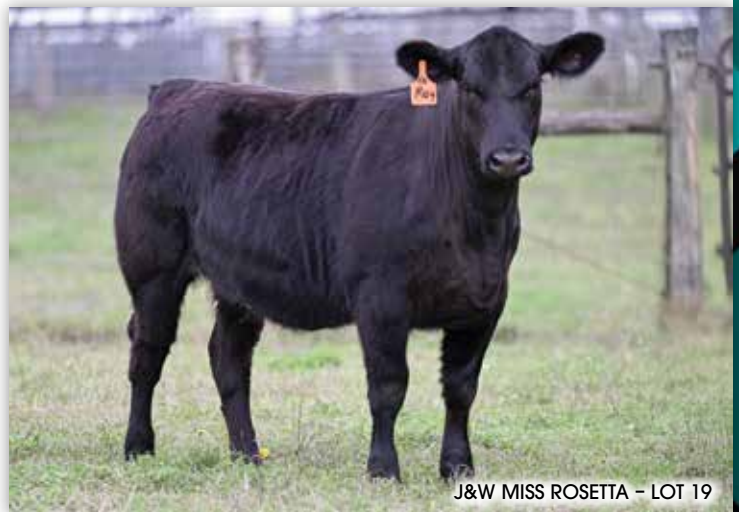
J&W MISS ROSETTA - LOT 19