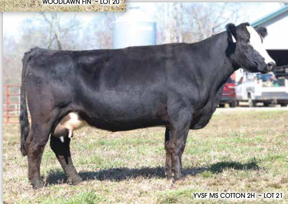
YVSF MS COTTON 2H - LOT 21