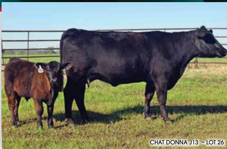
CHAT DONNA J13 - LOT 26