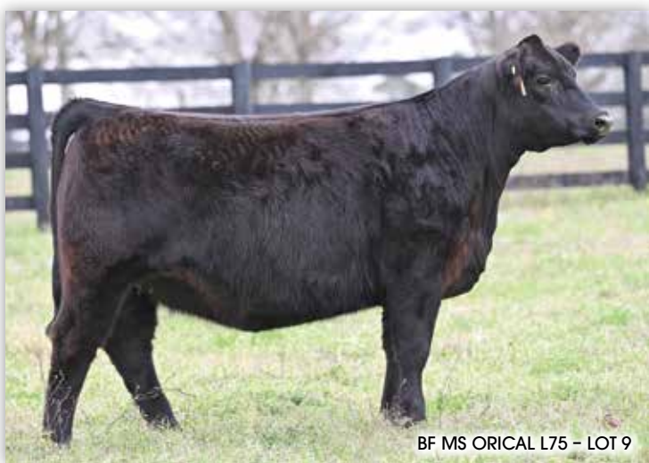
BF MS ORICAL L75 - LOT 9

| Bred AI on 1/1/25 to Hooks Shear Force 38K, ASA#2081939 | PE from 1/17/25 to 3/17/25 to WHF Lover Boy K003 consignor Boyd Farm