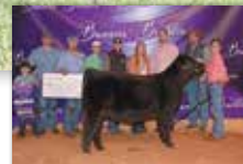
MISS GRACE 10G DAM OF LOT 7