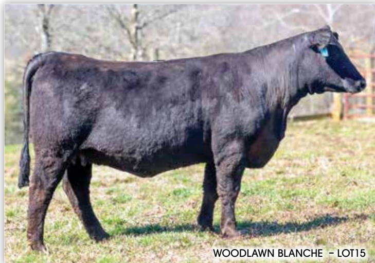
WOODLAWN BLANCHE - LOT 15