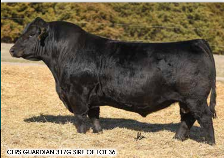
CLRS GUARDIAN 317G SIRE OF LOT 36

One of the phenotypic standouts of this year's bull crop, BCFL Reserve 810M will command your attention when you study him. He is square built, deep sided, and eye catching in his makeup, its hard to pick a hole in this stud. He leads the charge of the ultra-impressive LCDR Reserve 210J sons in this sale that will be admired by cattlemen all over. He came to weaning pen to mash the scales at 856 lb, weaning weight. On of the heaviest in this year's crop. Homozygous Polled consignor Brantley Cattle Co.