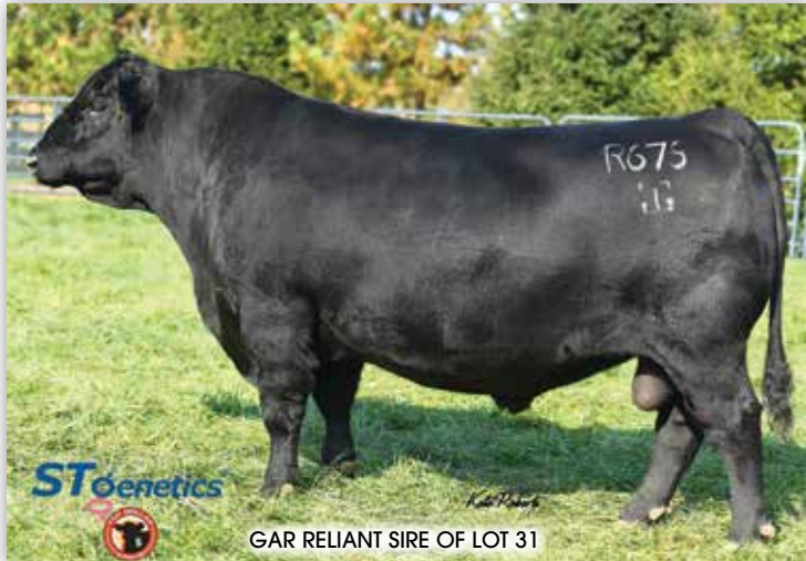
GAR RELIANT SIRE OF LOT 31