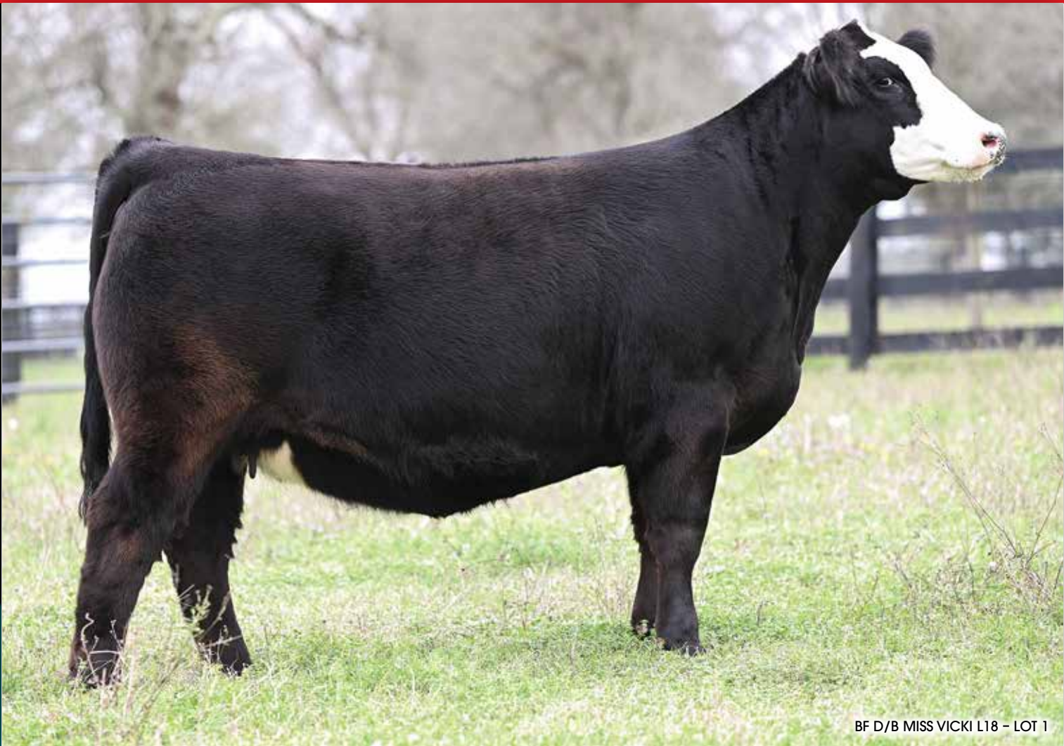
BF D/B MISS VICKI L18 - LOT 1