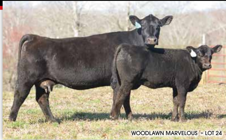
WOODLAWN MARVELOUS - LOT 24