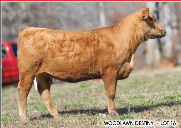
WOODLAWN DESTINY - LOT 16