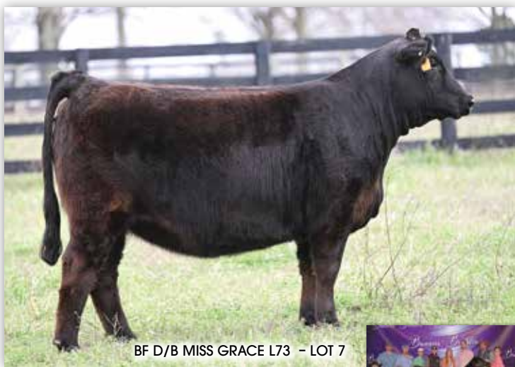
BF D/B MISS GRACE L73 - LOT 7

| Bred AI on 12/27/24 to W/C Loaded Up 9206J, ASA#3974354 | PE from 1/17/25 to 3/17/25 to WHF Lover Boy K003 consignor Boyd Farm