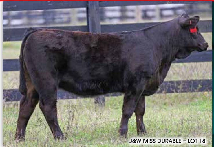
J&W MISS DURABLE - LOT 18