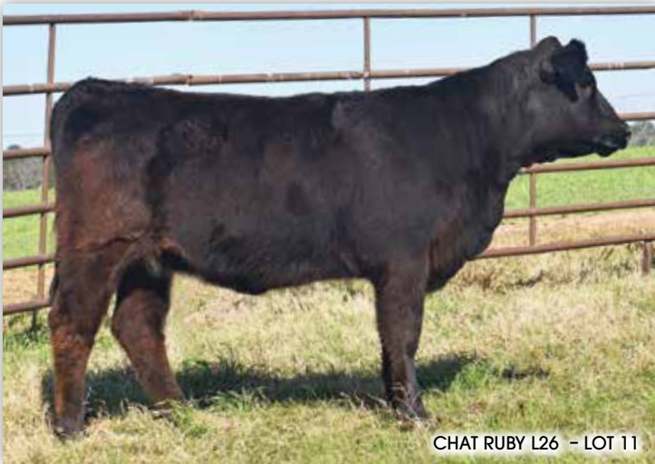
CHAT RUBY L26 - LOT 11