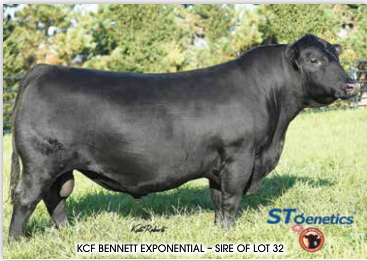
KCF BENNETT EXPONENTIAL - SIRE OF LOT 32