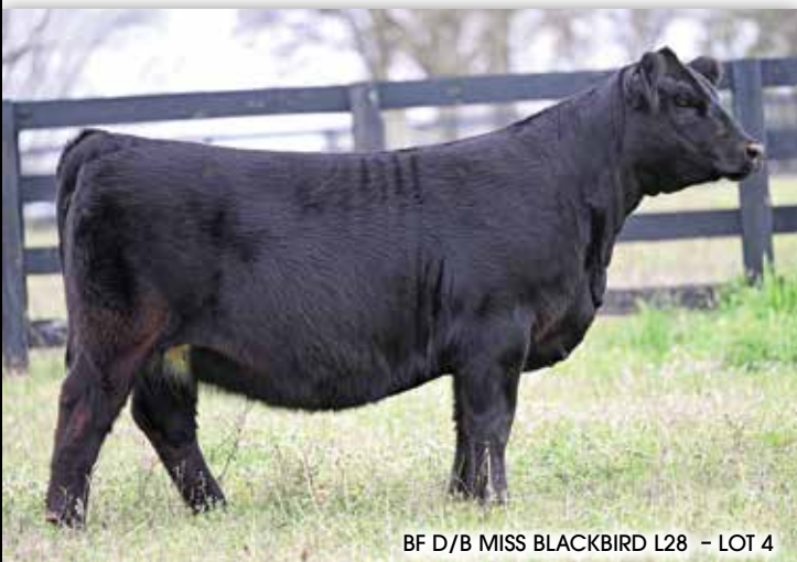
BF D/B MISS BLACKBIRD L28 - LOT 4