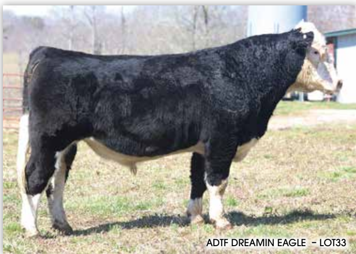
ADTF DREAMIN EAGLE - LOT33