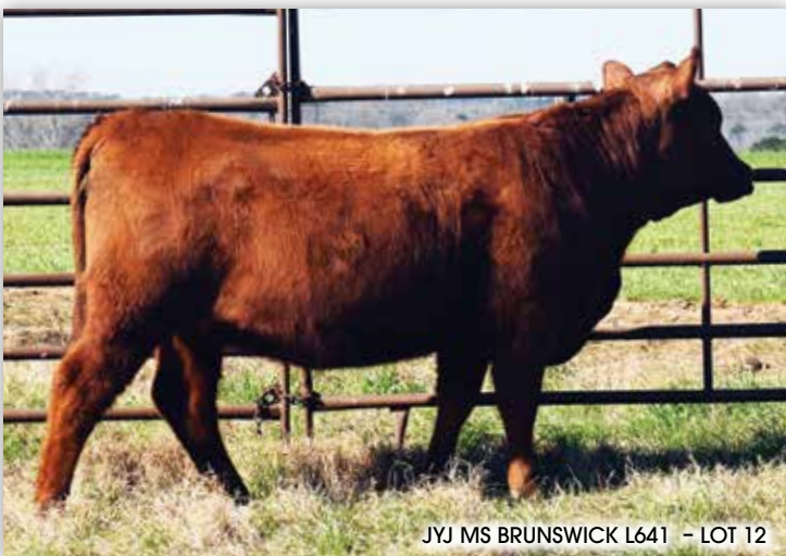
JYJ MS BRUNSWICK L641 - LOT 12