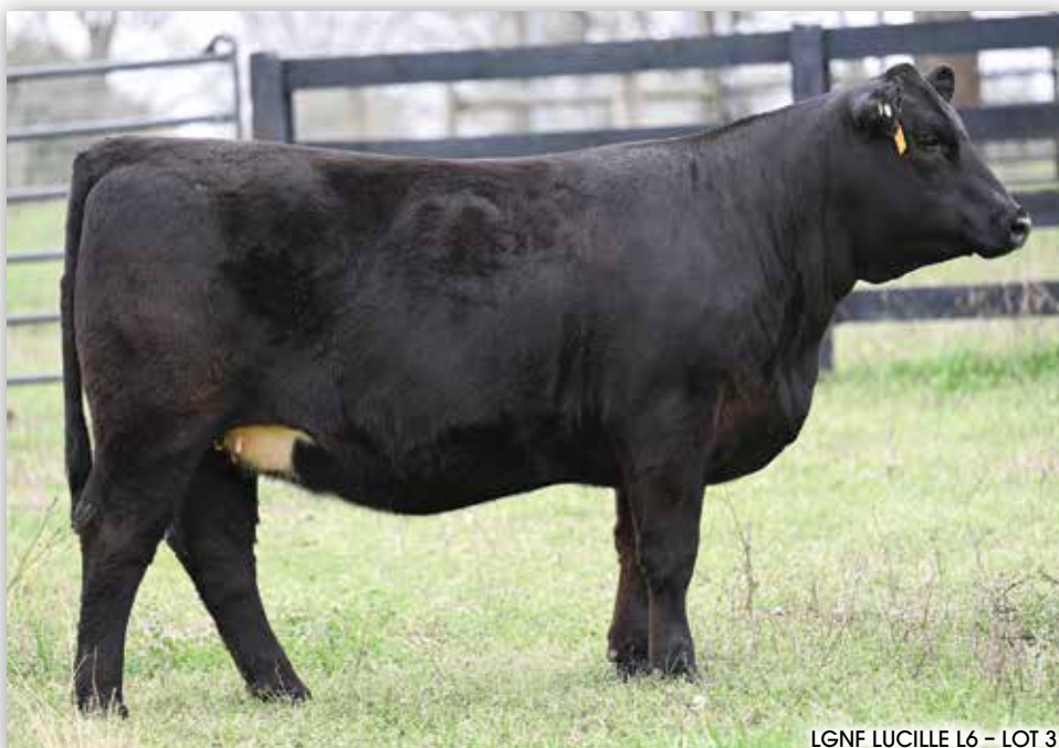
LGNF LUCILLE L6 - LOT 3

| Bred AI on 11/27/25 to WS Enhancement 25H, ASA#3764886 consignor Logan Farm