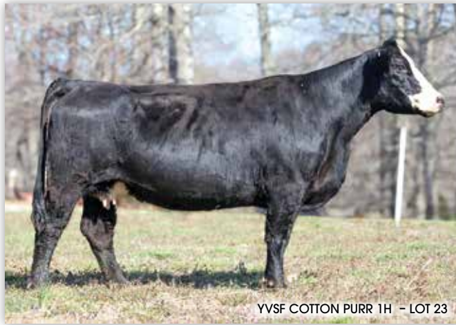
YVSF COTTON PURR 1H - LOT 23