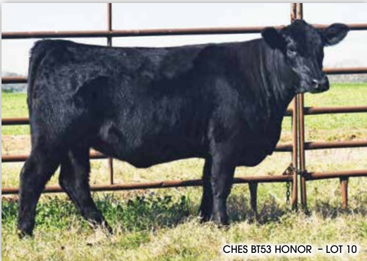
CHES BT53 HONOR - LOT 10