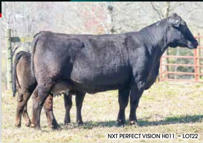
NXT PERFECT VISION H011 - LOT22