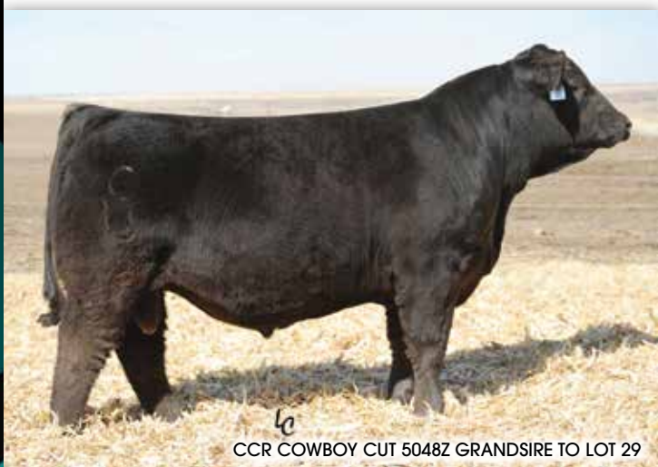
CCR COWBOY CUT 5048Z GRANDSIRE TO LOT 29